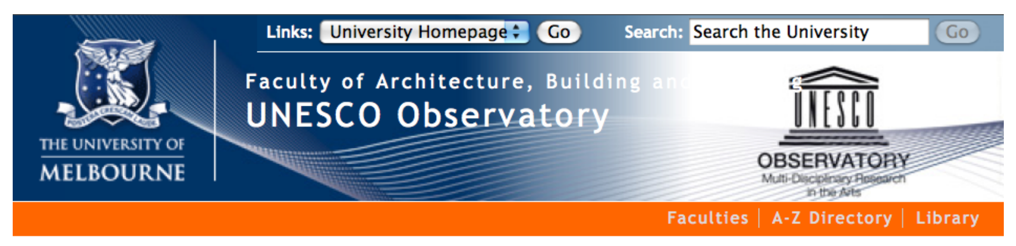
Home > About UNESCO Observatory