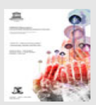
GOAL 3: Apply arts education principles and practices to contribute to resolving the social and cultural challenges facing today's world